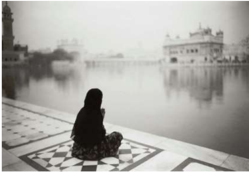
Amritsar #376 , Himachal Pradesh, India, 2009

Two sisters with their hands clasped in Dwarka #433 , Gujarat, India, 2010, are visitors to a sacred temple located in the Western most part of India. Many of the pilgrims, including these sisters, wear exotic dress on their visits. Dwarka is located in Gujarat, the state where Gandhi was born.