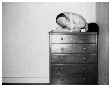
The Hollywood Suites (Nudes) #06, 1974-75